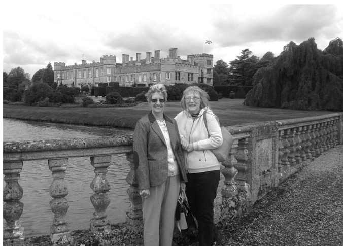
Two dodgy characters got in the way of this picture of Deene Park. Luckily a warden was on hand to shoo them off...