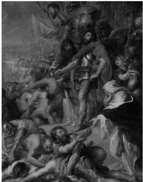
The Triumph of Judas Maccabeus Rubens