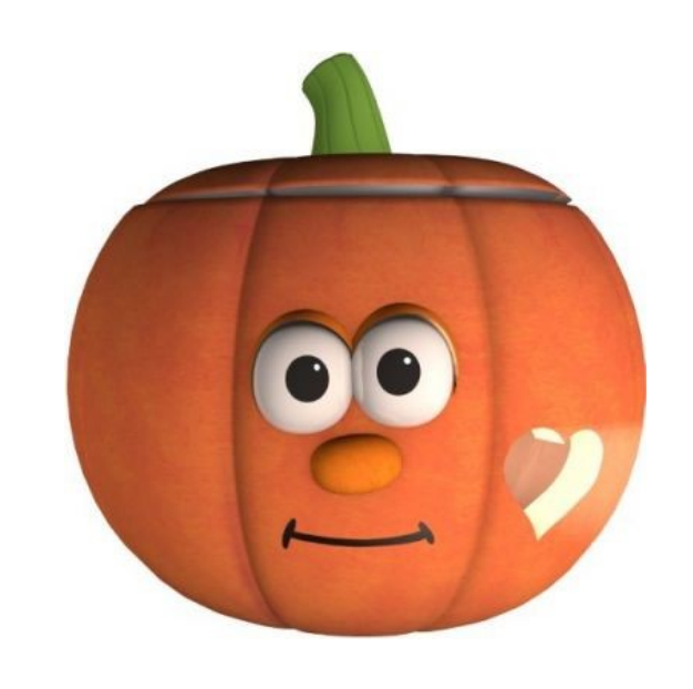
Patch the pumpkin See page 11