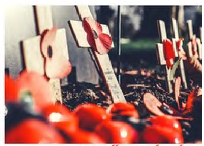
...We will remember them