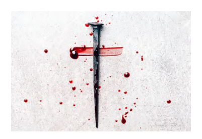
Jesus: Our Saviour

I don't think we can imagine an affirmation that would meet with more resistance from contemporary Westerners than the one Paul makes in I Timothy 2:5: "For there is one God, and there is one mediator between God and men, the man Christ Jesus. "This declaration is powerful and hit the soul. We have been inundated with the viewpoint that there are many roads that lead to heaven, and that God is not so narrow that He requires a strict allegiance to one way of salvation. If anything strikes at the root of the tree of pluralism and relativism, it is a claim of exclusivity to any one religion. A statement such as Paul makes in his first letter to Timothy seem's hateful.